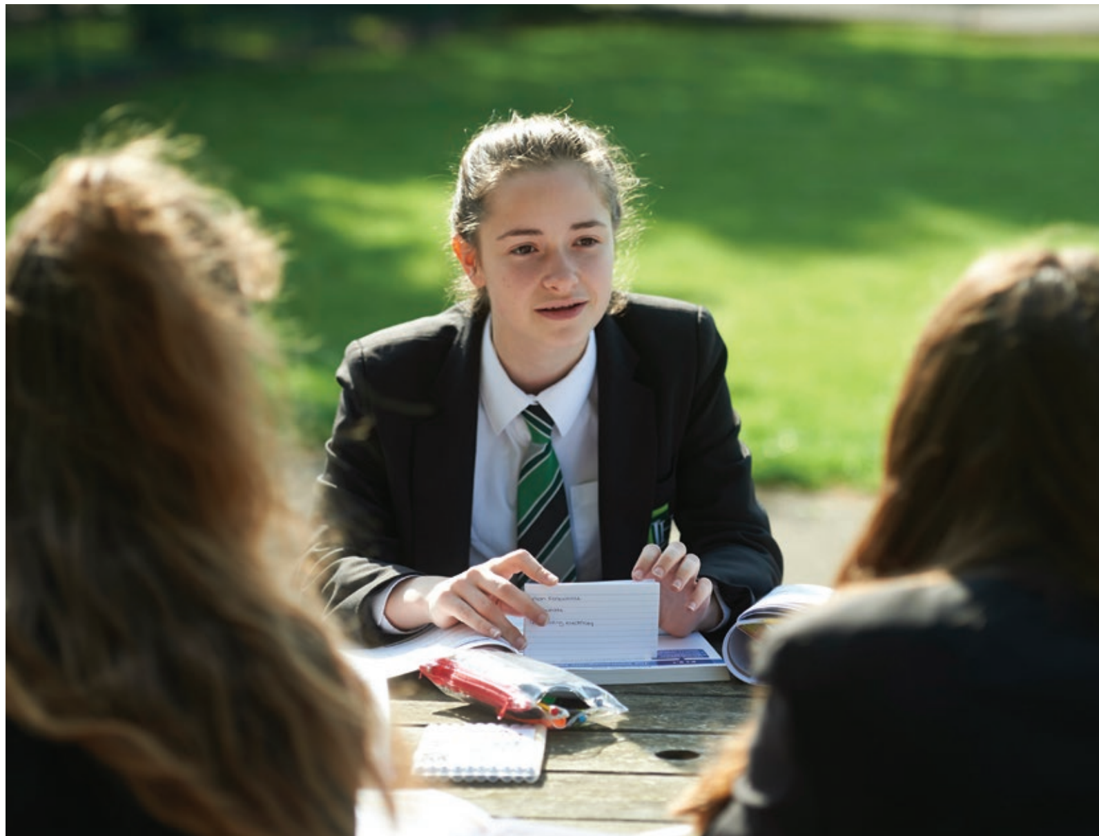
Lutterworth High School